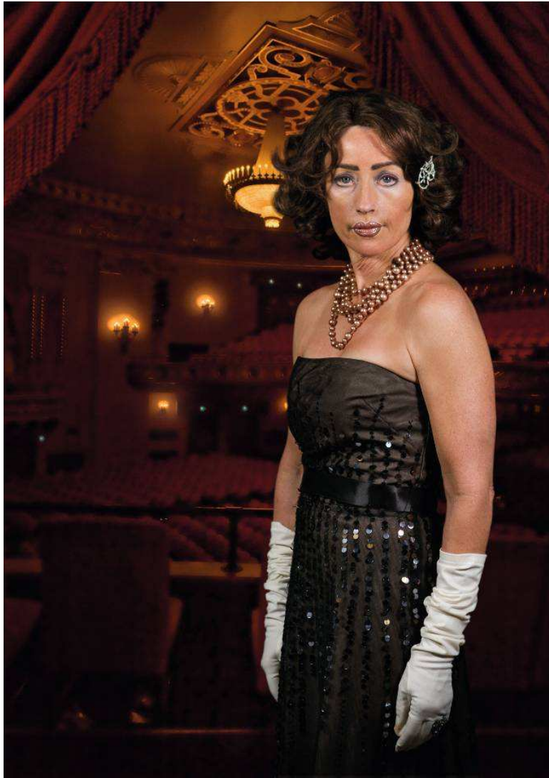
Cindy Sherman, Untitled 464, 2008, C-Print, 214.3 x 152.4cm