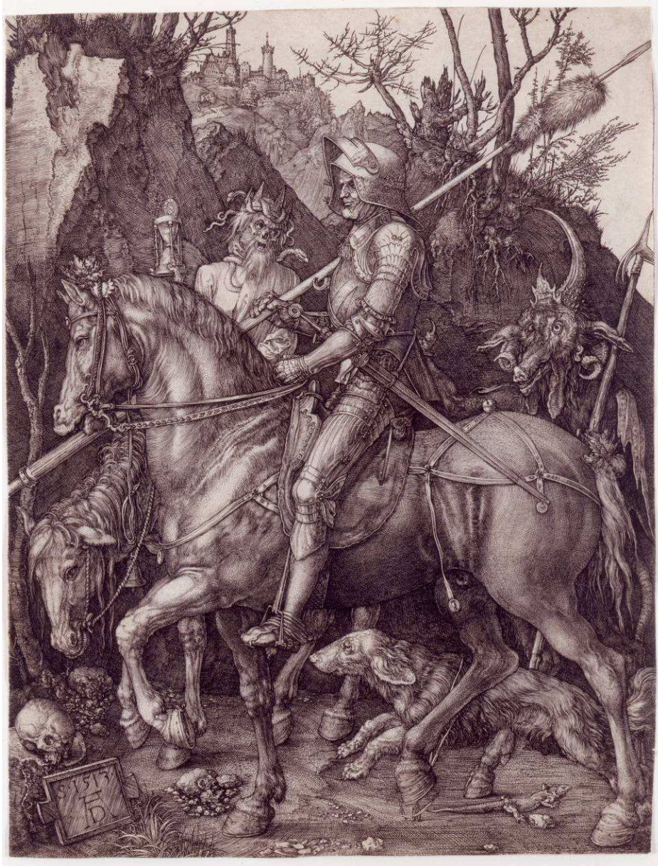
Albrecht Dürer, Knight, Death and the Devil, engraving, 24.2 x 18.6 cm