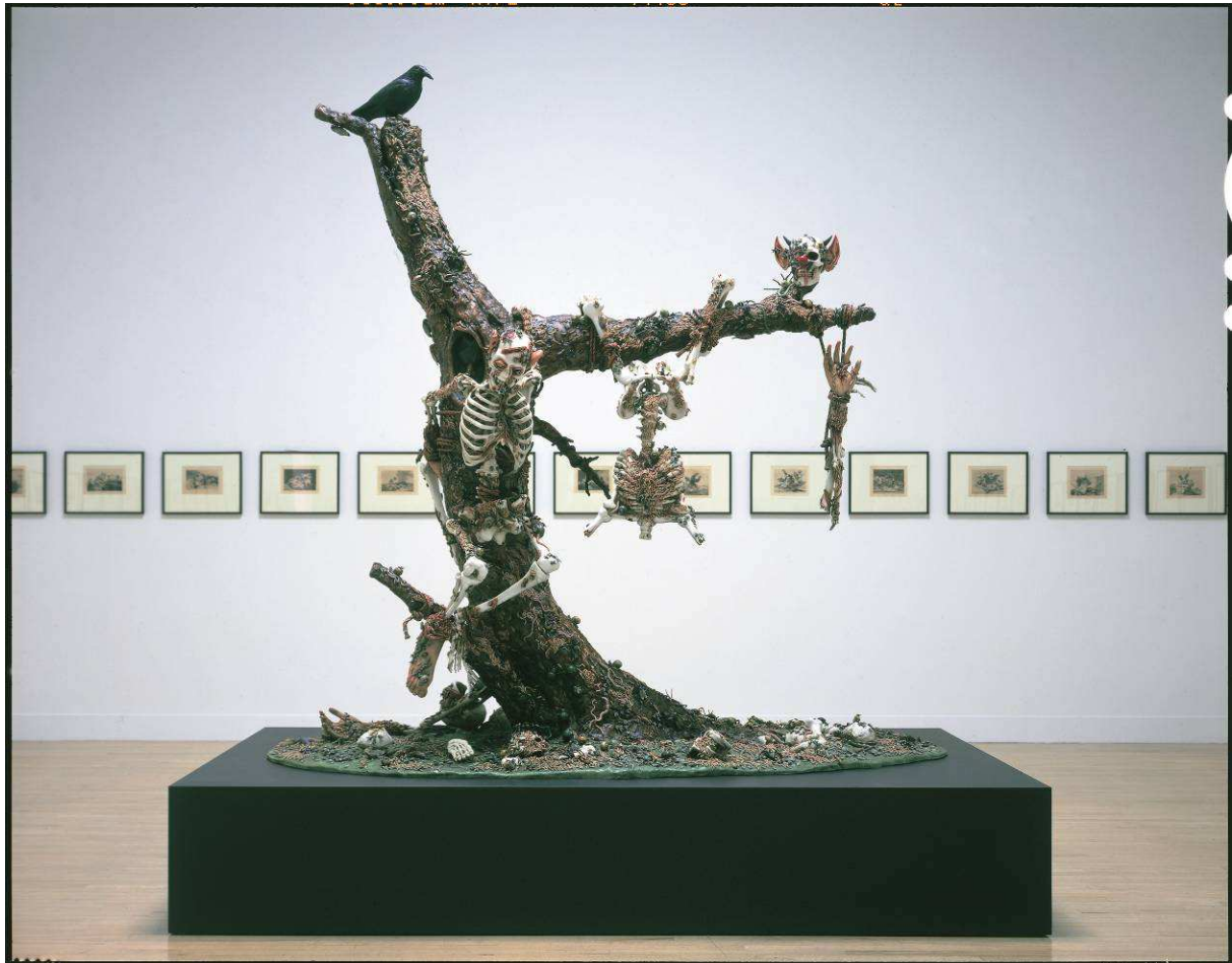
Jake and Dinos Chapman, Sex I, 2003, painted bronze, 246 x 244 x 125 cm