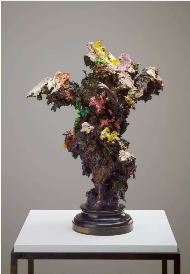
Glenn Brown, Nympe des Bois , 2011, oil and acrylic on bronze, 51 x 31 x 28 cm