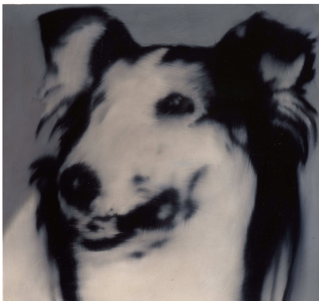
Gerhard Richter, Hundekopf (Lassie), 1965, oil on canvas, 42 x 40 cm