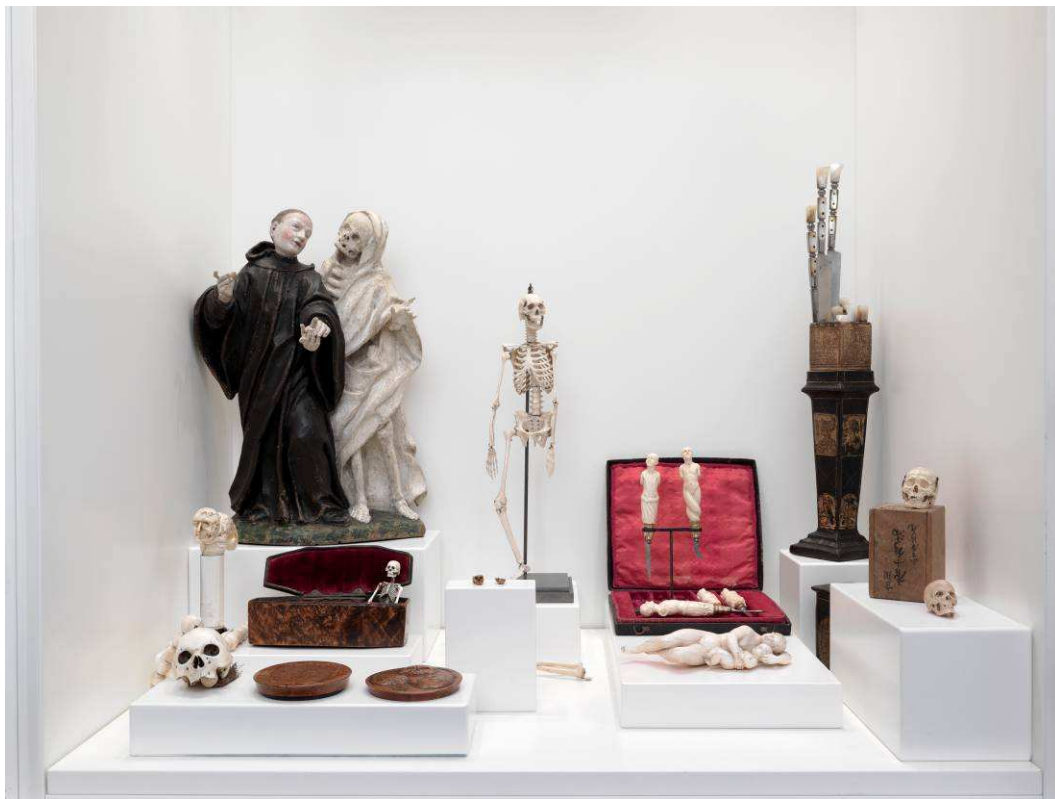
Elements from the Wunderkammer