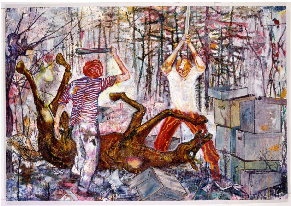
Daniel Richter, Das Recht, 2001, oil and varnish on canvas, 255 x 370 cm