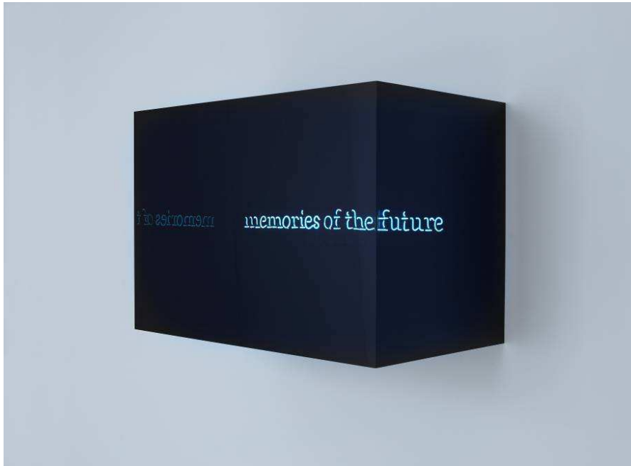
Laurent Grasso, Memories of the Future, 2010, neon, Plexiglas box, 50 x 74 x 42 cm