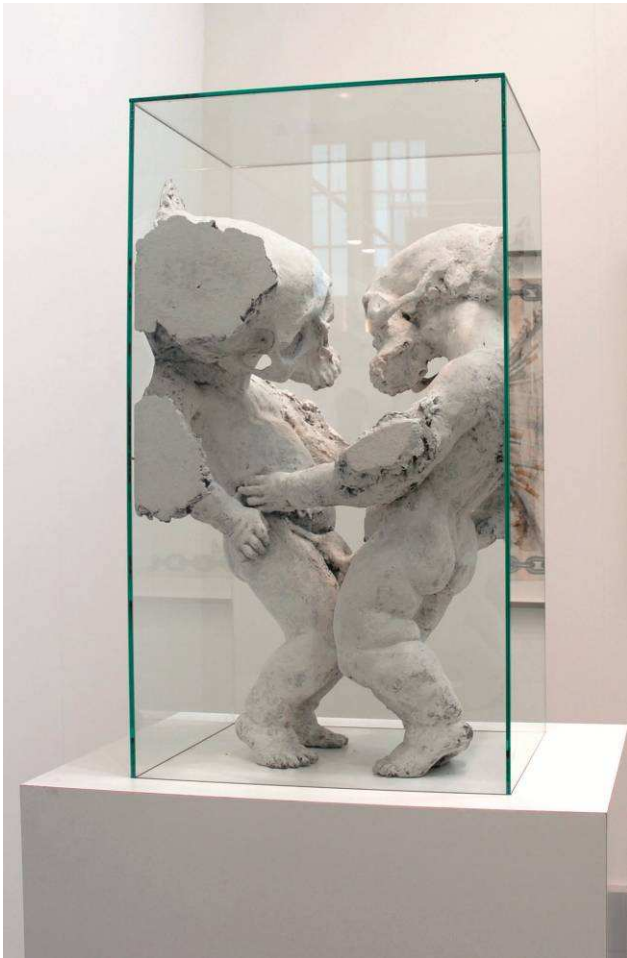
Thomas Lerooy, The Kiss , 2009, painted bronze, glass, 85 x 46 x 36 cm