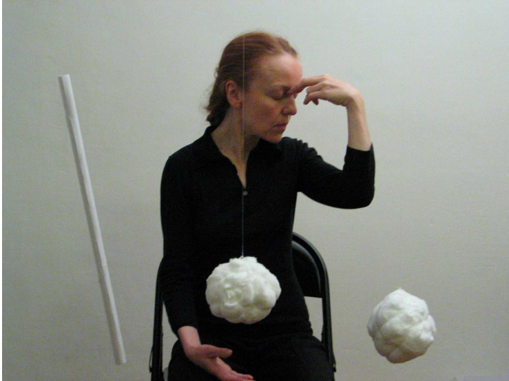
Untitled 2005, Ouate, papier