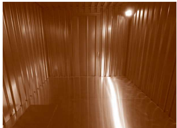
View of the installation

Süßer duft (sweet smell) is the first time Gregor Schneider has used manmade smells in his work. Imperceptibly, they alter our perception of the space, our behaviour and our mental images. Visitors perceive two very different types of smell, an opposition which Gregor Schneider prefigures using the invitation to the opening: the evocative title Süßer duft, sweet smell, is covered with a silver film which, when scratched, releases an unpleasant smell of burnt rubber.