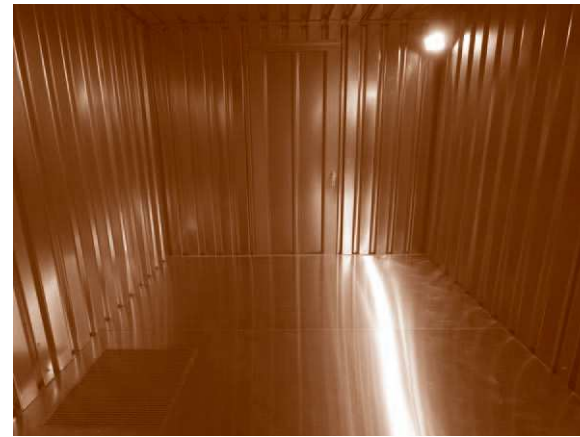
View of the installation

Süßer duft (sweet smell) is the first time Gregor Schneider has used man-made smells in his work. Imperceptibly, they alter our perception of the space, our behaviour and our mental images. Visitors perceive two very different types of smell, an opposition which Gregor Schneider prefigures using the invitation to the opening: the evocative title Süßer duft , sweet smell, is covered with a silver film which, when scratched, releases an unpleasant smell of burnt rubber.