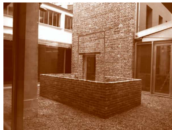
View of the installation