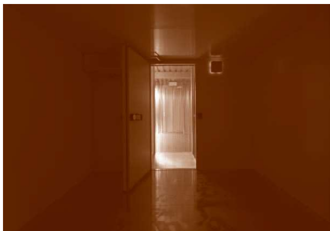
View of the installation

Born in Germany in 1969, Gregor Schneider came to public attention with Haus ur (House ur), the house in which he lives and works in his hometown of Rheydt in the Ruhr. A work in progress between 1985 and 2007, he continually altered and rebuilt the house, incorporating new rooms and secret passageways, building rooms within rooms, blocking windows, building walls in front of walls and isolating rooms from the rest of the structure, to the point where the work developed a life of its own. During the 1990s he