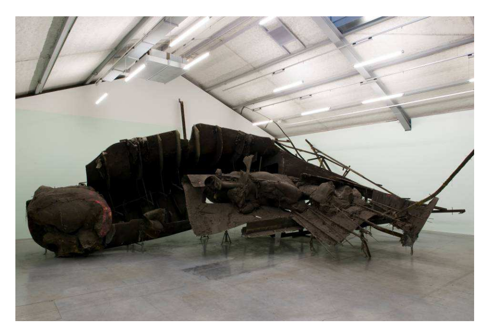
View of the exhibition

An alumnus of the Valence School of Fine Arts, Christophe Gonnet has built many installations in both urban and natural environments, particularly as commissions for public spaces ( La Pinatelle du Zouave in Le-Puy-en-Velay, L'Arbre qui cache la Forêt in Rouen, Ombres Portées in La Motte-Servolex).