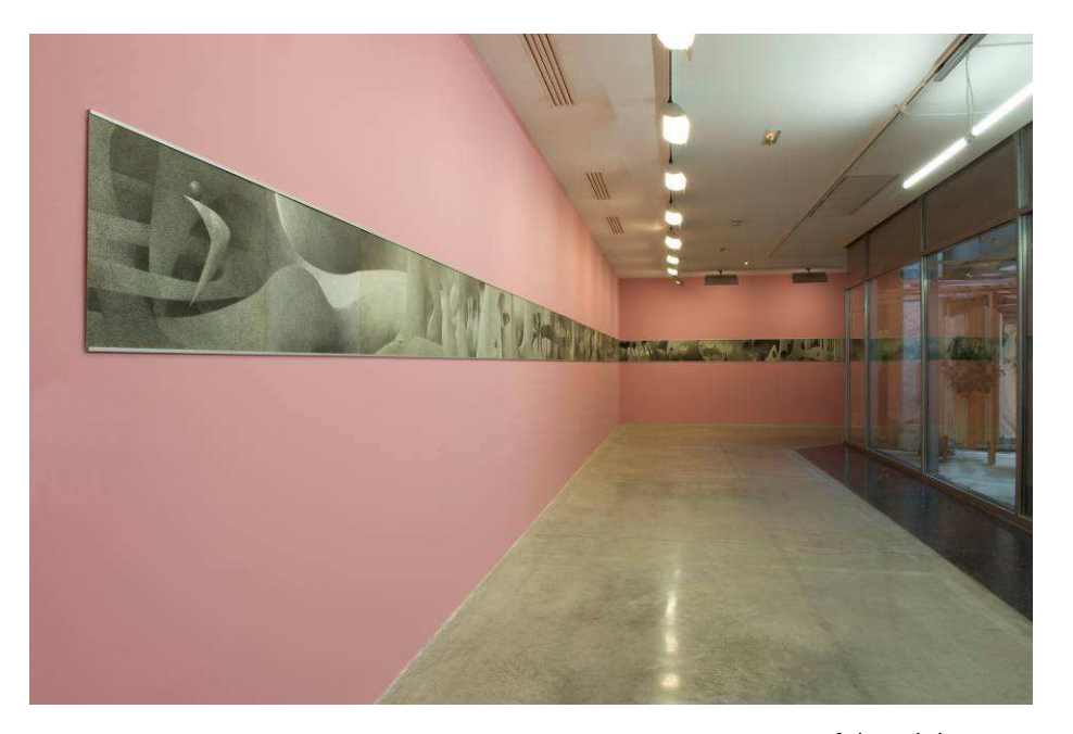
View of the exhibition