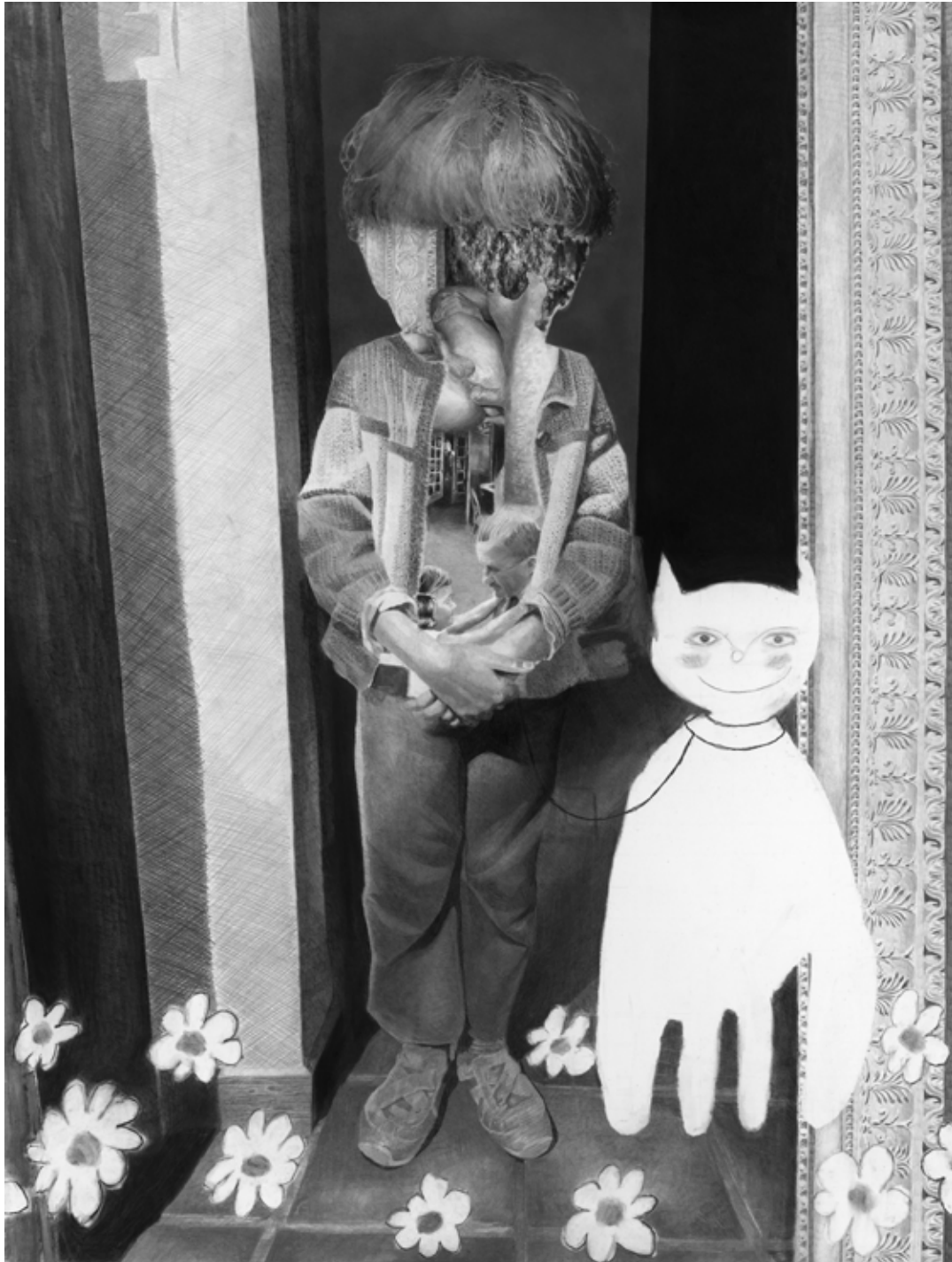
Pierre-Francois et le chat qui rit, Graphite and charcoal on paper, 200 x 150 cm, private collection, France

Jérôme Zonder, Fatum Exhibition: February 19 – May 10, 2015