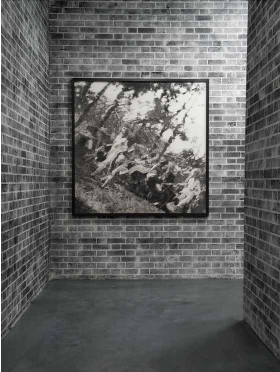
view exhibition Fatum