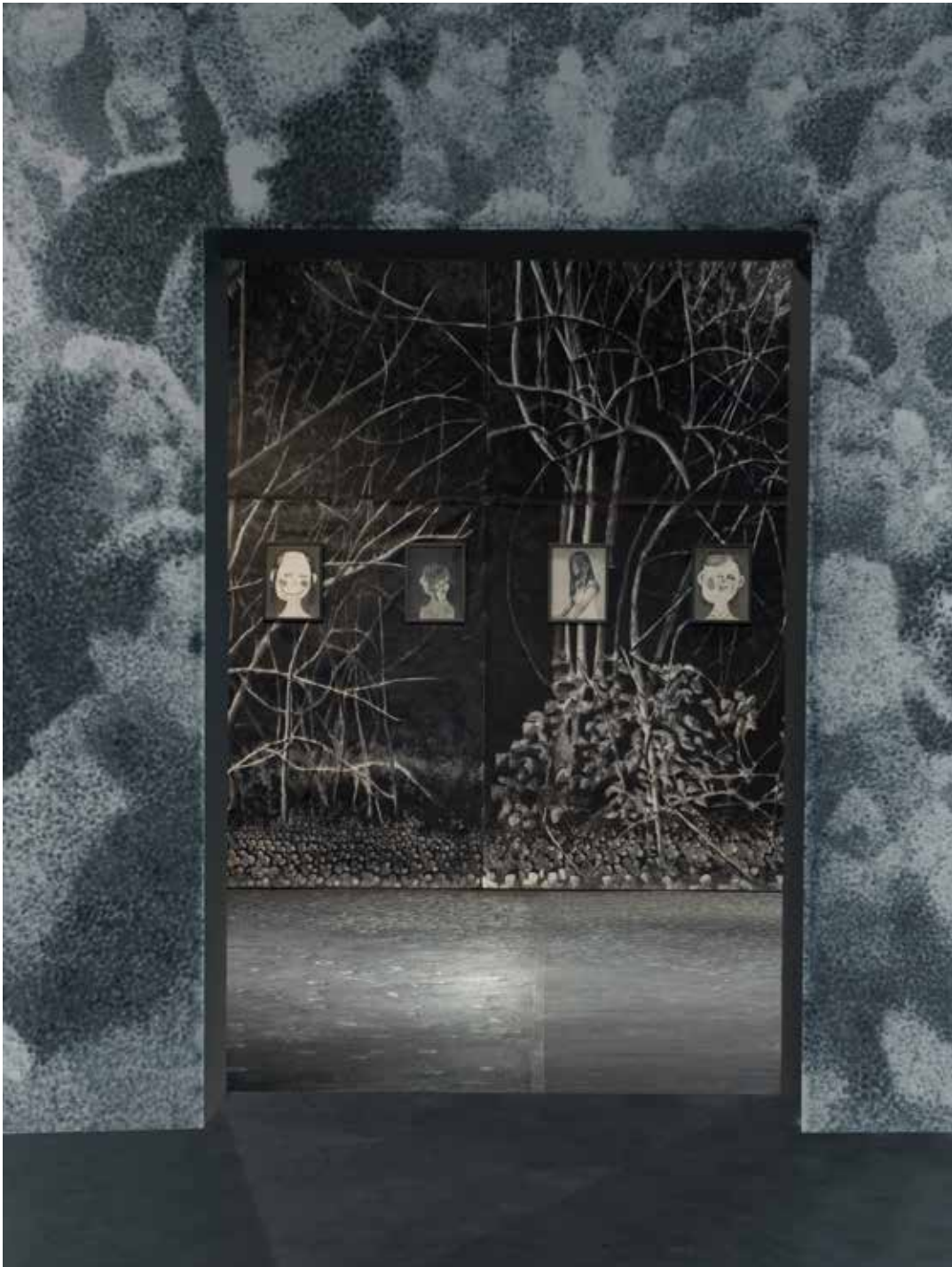
view exhibition Fatum