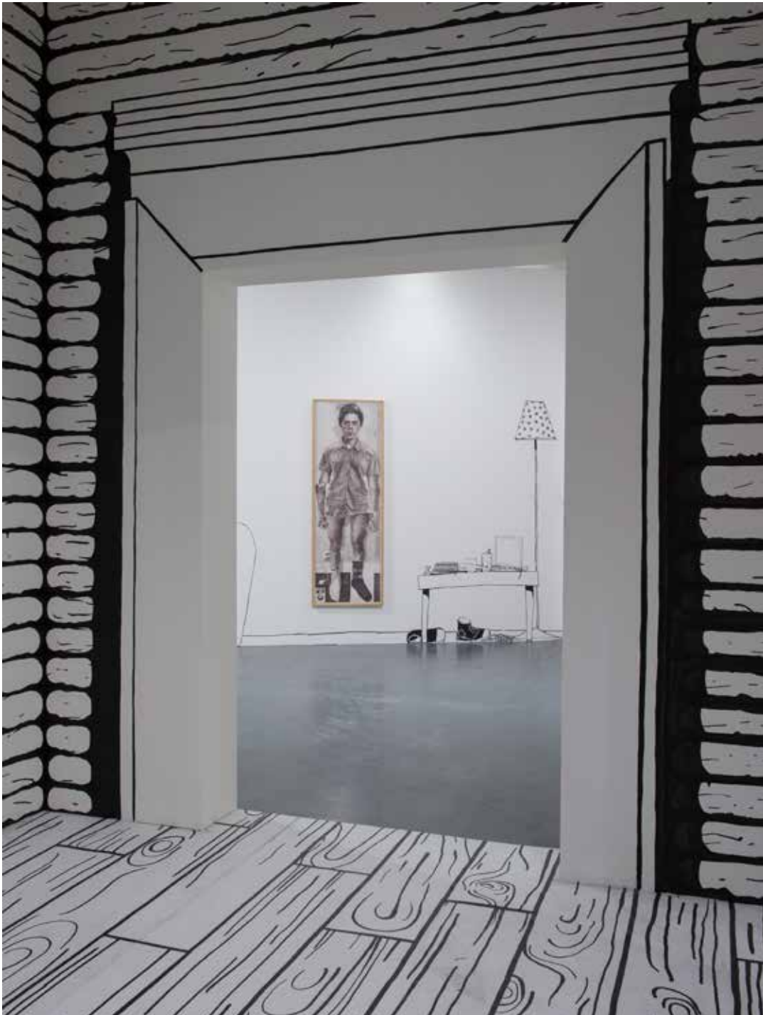
view exhibition Fatum