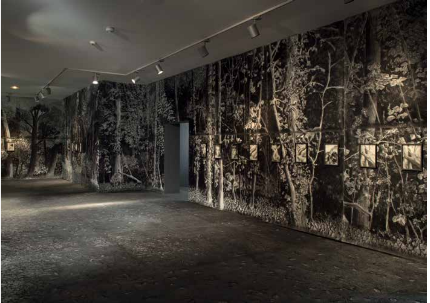
view exhibition Fatum