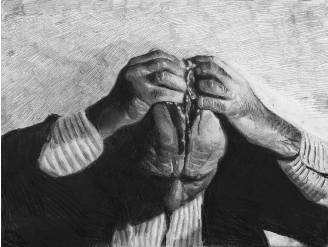
Les fruits de McCarthy #2, 2013. Graphite and charcoal on paper, 24 x 32 cm, courtesy galerie Eva Hober Paris

Jérôme Zonder, Fatum Exhibition: February 19 – May 10, 2015