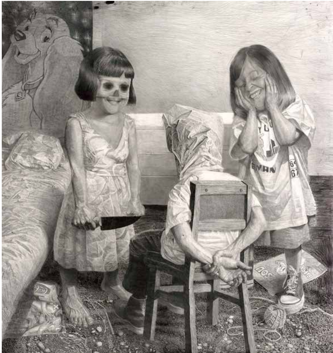
Jeu d'enfants #1, 2010, Graphite and charcoal on paper, 160 x 160, private collection, France

Jérôme Zonder, Fatum Exhibition: February 19 – May 10, 2015