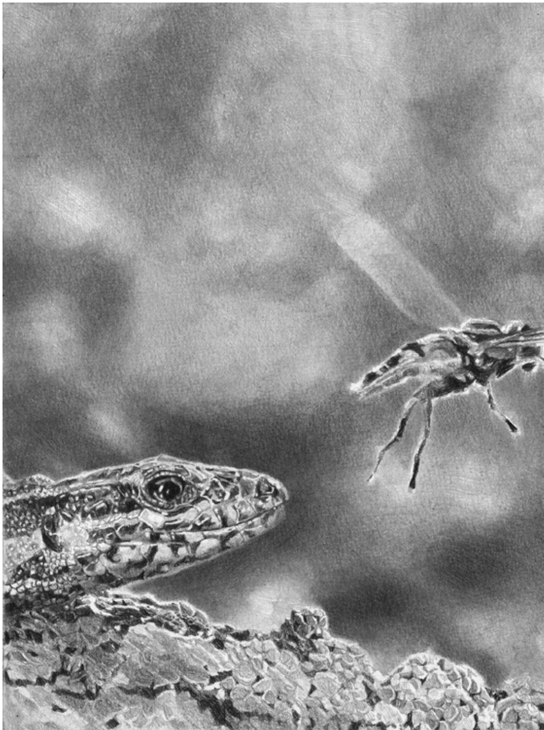
Les fruits du dessin #7, 2013 Graphite and charcoal on paper, 24 x 32 cm, courtesy galerie Eva Hober Paris

Jérôme Zonder, Fatum Exhibition: February 19 – May 10, 2015