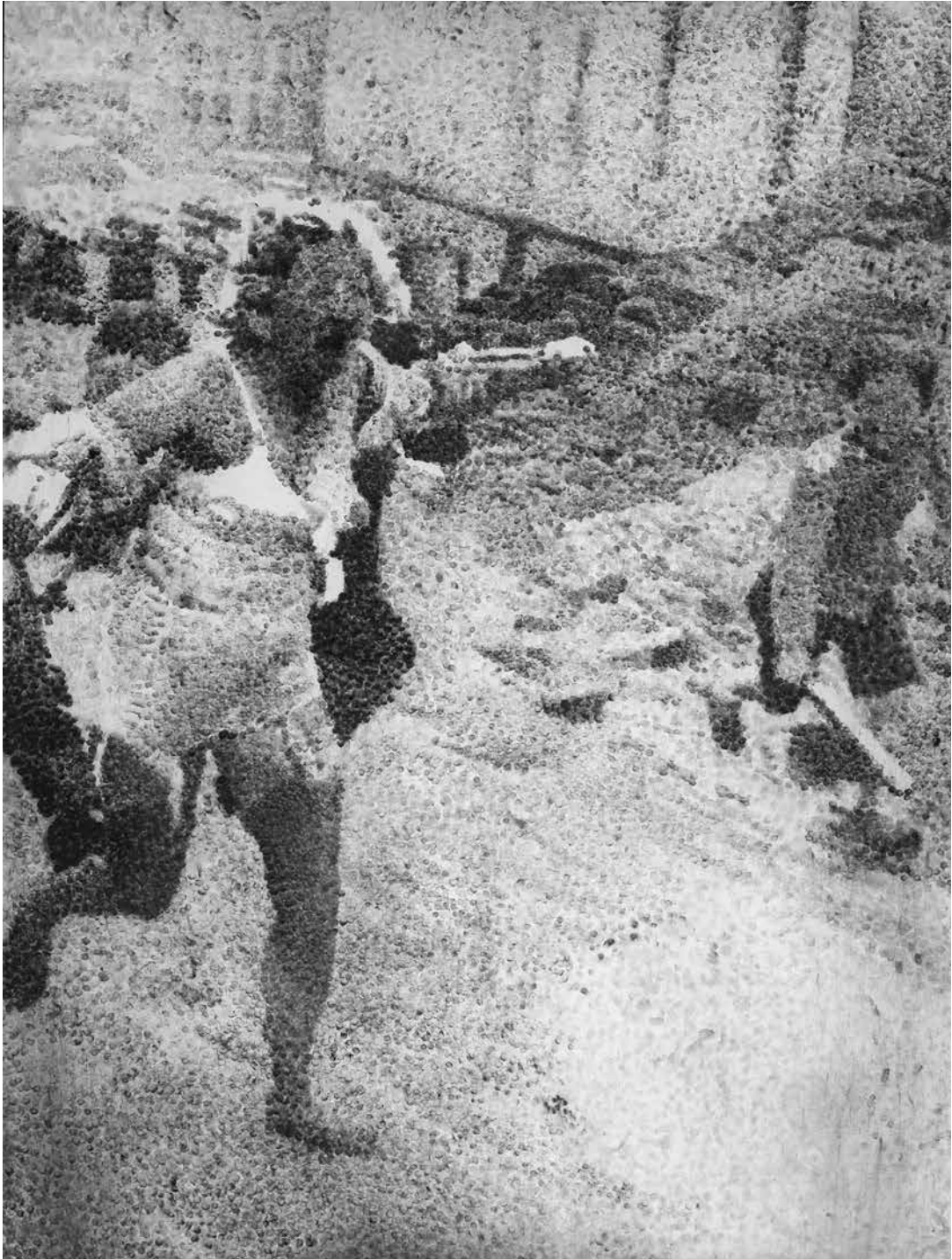
Chairs grises #11, 2014, charcoal and graphite powder, 150 x 200 cm, courtesy galerie Eva Hober Paris

Jérôme Zonder, Fatum Exhibition: February 19 – May 10, 2015